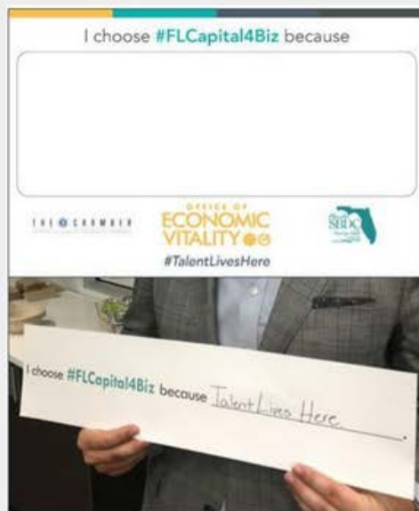
Social Media Campaigns

Celebrate National Economic Development Week with OEV and partners!